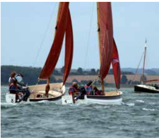
Will we see William and Kate on the water next year?

We whole heartedly agree with this campaign statement that can be found on the 1851 website. It is important to make sailing and the marine industry accessible to all of the young people living within Britain. We are an island nation with a long and proud heritage of being home to some of the worlds most famous and legendary sailors, boat builders and explorers. We make our greatest discoveries, and experience moments of triumph, when the boundaries are pushed. We need to keep pushing against the bureaucratic boundaries that are being set which makes it difficult to assist young people, from all backgrounds, in getting out on the water.