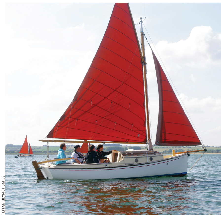
STEFFAN MEYRIC HUGHES